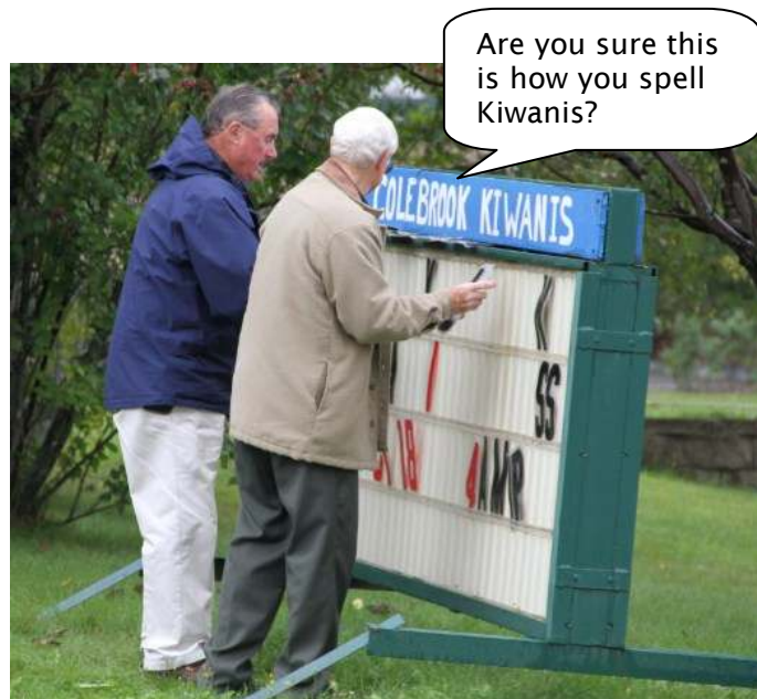
These two shady characters were spied working on the Kiwanis sign recently.