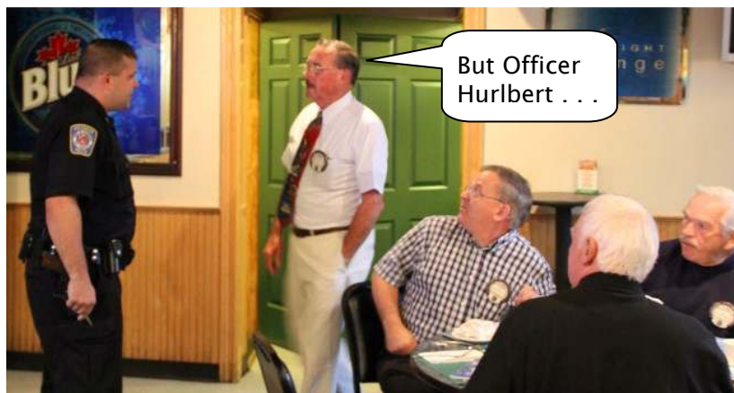
What Colebrook Kiwanian recently had a run-in with the local PD?