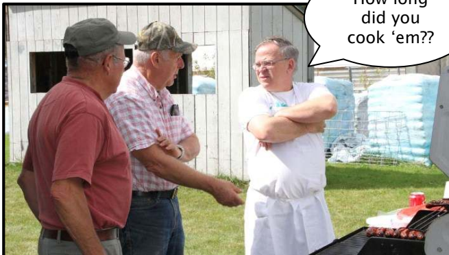
A meeting of the minds??