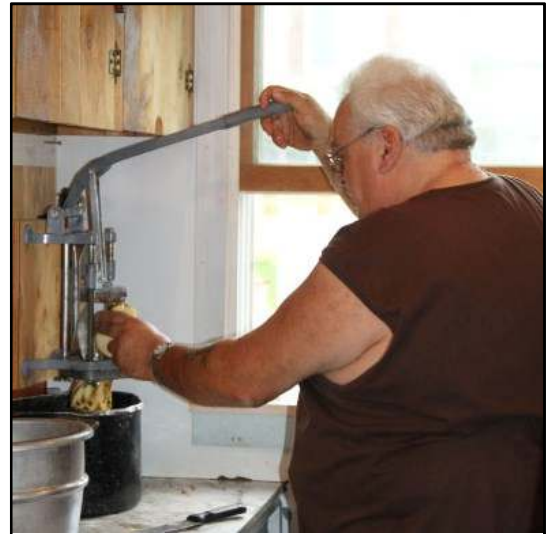
French Fries Anyone??