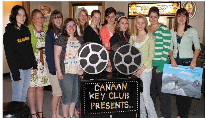
Canaan Key Club's Non-Traditional Scrapbook Entry